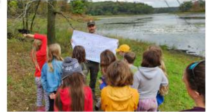
Namekagon River Visitor Center TREGO, WI