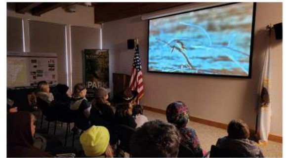
St. Croix River Visitor Center ST. CROIX FALLS, WI