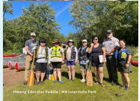
Hmong Educator Paddle | MN Interstate Park